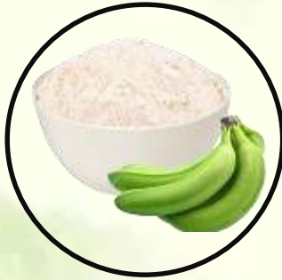
❖ Banana Powder