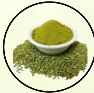
❖ Souf Powder