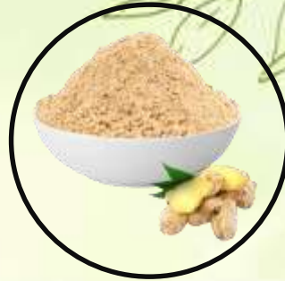
❖ Ginger Powder