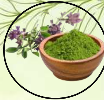
Alfa Alfa Powder