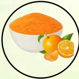
❖ Orange Powder