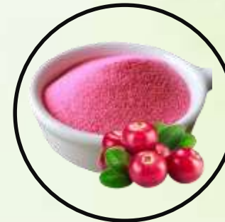
❖ Cranberry Powder