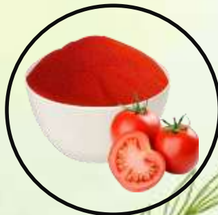
❖ Tomato Powder