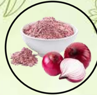
❖ Onion Powder