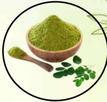
Moringa Leaf Powder