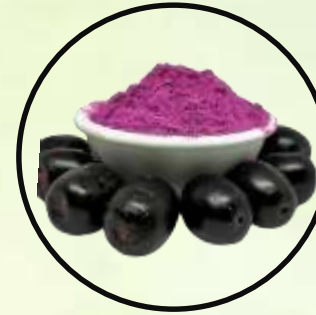
❖ Jamun Powder