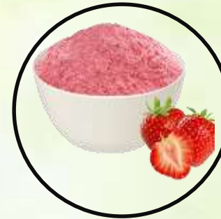
❖ Strawberry Powder