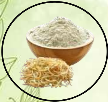
Safed Musli Powder