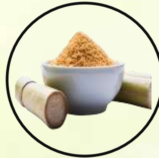
❖ Sugarcane Powder