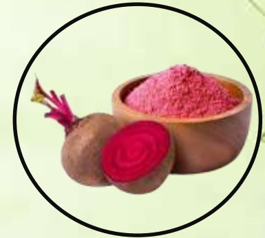
Beet Root Powder