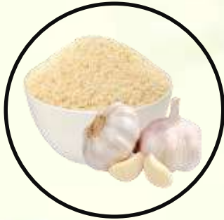
❖ Garlic Powder