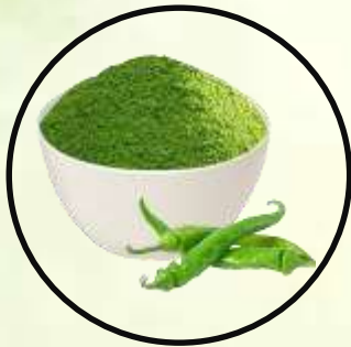
❖ Green Chilli Powder