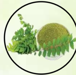
❖ Curry Leaves Powder