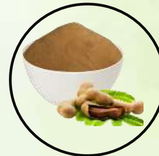
❖ Imli Powder