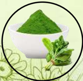
❖ Spinach/ Palak Powder